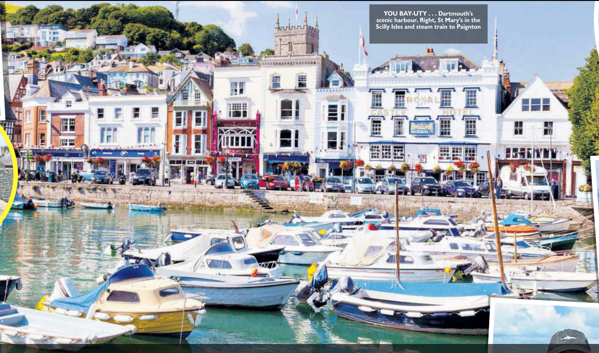
YOU BAY-UTY . . . Dartmouth's scenic harbour. Right, St Mary's in the Scilly Isles and steam train to Paignton