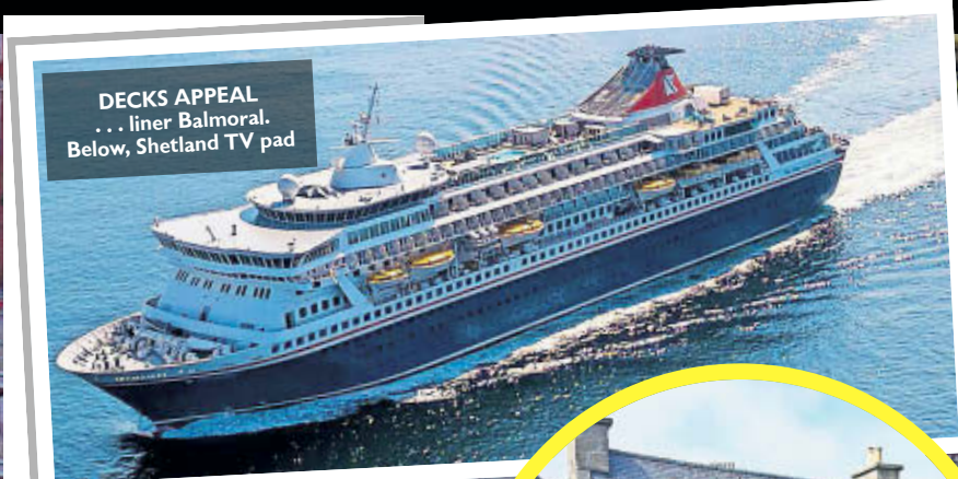
DECKS APPEAL . . . liner Balmoral. Below, Shetland TV pad

You'll get breakfast and dinner in both pubs which brim with charm. It's all about switching off, stretching your legs, and tucking into something delicious at the end of the day. Costs £199pp. See theswantarporley.co.uk or call 01829 733838.