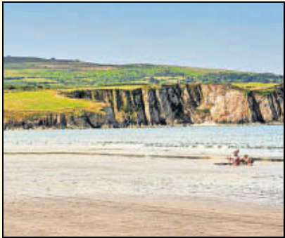
MAWR TO SEE . . . Newport's big beach

COTTAGE PICK: Set on Main Street in the heart of the bustling town, Welford House sleeps six and features a stunning Mediterranean-style paved courtyard. A seven-night stay starts at £680. For something more rural, Ty Top is a delightful two-bedroom end-of-terrace stone cottage set on an ancient track beneath Carningli mountain. A seven-night stay starts at £535. See coastalcottages.co.uk .